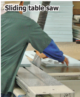
Sliding table saw

Our Custom Fabrication Service offers an effective solution to companies struggling with the high costs of labour and staff turnover. Let Brock White handle the fabrication so you can focus on your areas of expertise. Call to discuss how we can help.