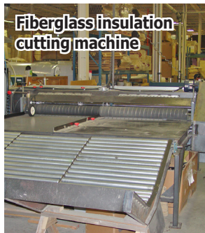
Fiberglass insulation cutting machine