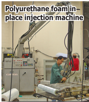
Polyurethane foam in-place injection machine