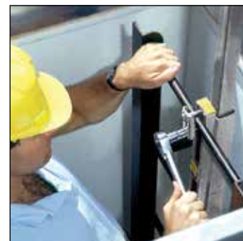
Installs easily on any fixed ladder