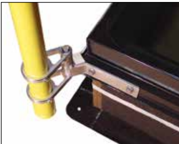
Pivoting Mounting Sleeve For installation flexibility