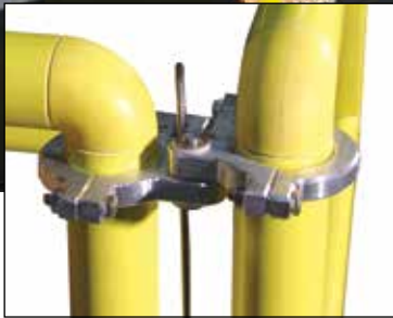
Self-Closing Gate Hinge Ensures continuous protection