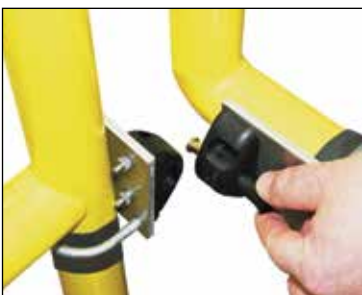
Gate Latch Locks gate in closed position

The Bil-Guard® is a fixed railing system that provides a permanent means of fall protection for hatch openings.