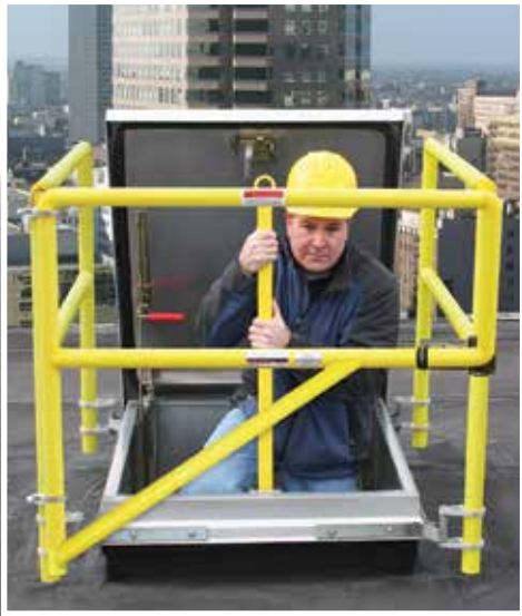
Bil-Guard® Hatch Rail System