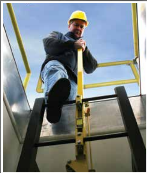
LadderUP® Safety Posts